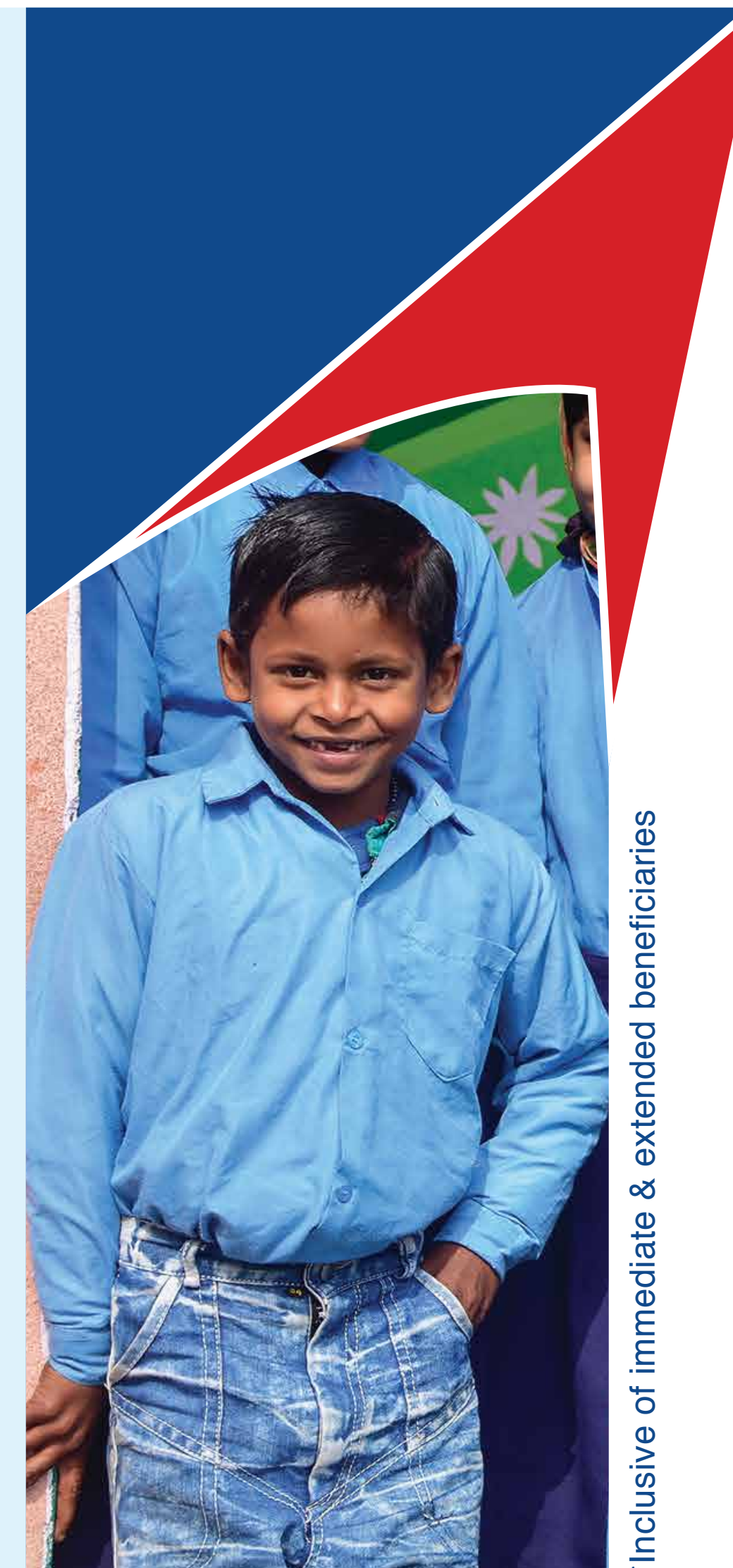
* Inclusive of immediate & extended beneficiaries