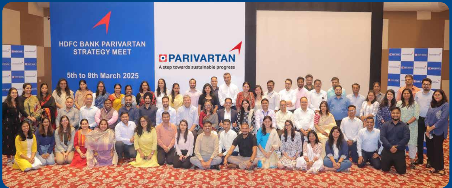
In Frame: HDFC Bank Parivartan team