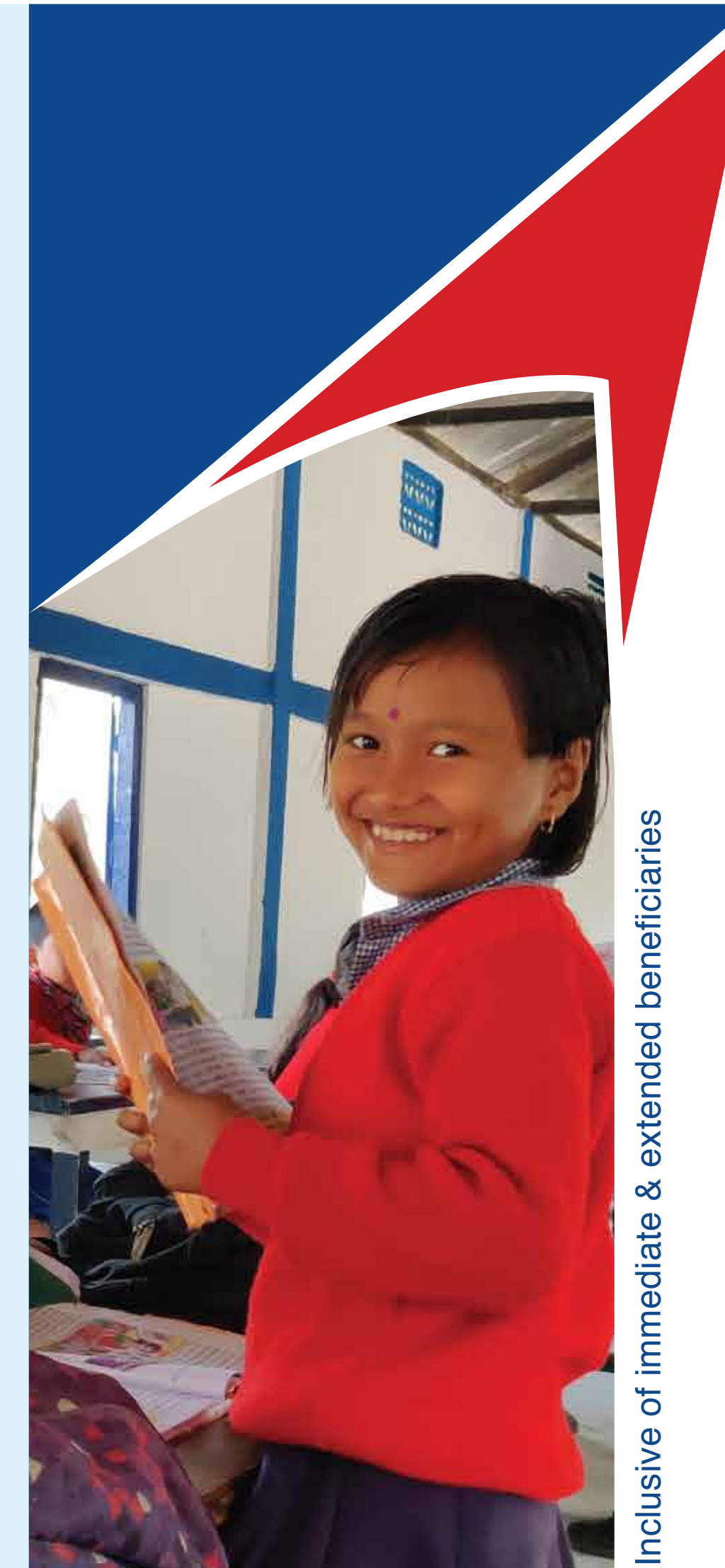
* Inclusive of immediate & extended beneficiaries